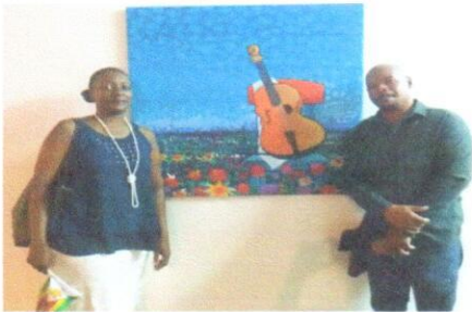
Title "Play a piece of music between two sounds"