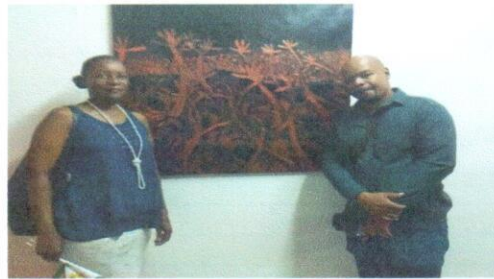
Title "Fight for fire"