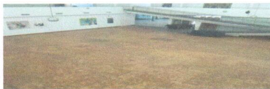
Hall of exhibition