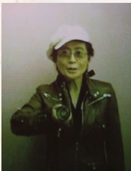
YOKO ONO b.1933 (America/Japan)