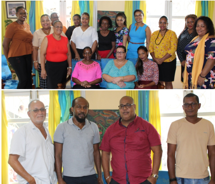
One of the new initiatives undertaken by NAC was the launch of a regular NAC Newsletter, the first edition of which was published in January 2021, featuring events, artists and projects ongoing in the country.

Overall NAC activities were compromised as a result of the pandemic, however, this did not deter the team from coming up with new and innovative ideas appropriate to the conditions in which we were operating – in fact if anything the pandemic made us try harder and adopt more creative approaches to keeping culture alive despite the pandemic. Our team had to step out of its normal comfort zone and push the envelope.